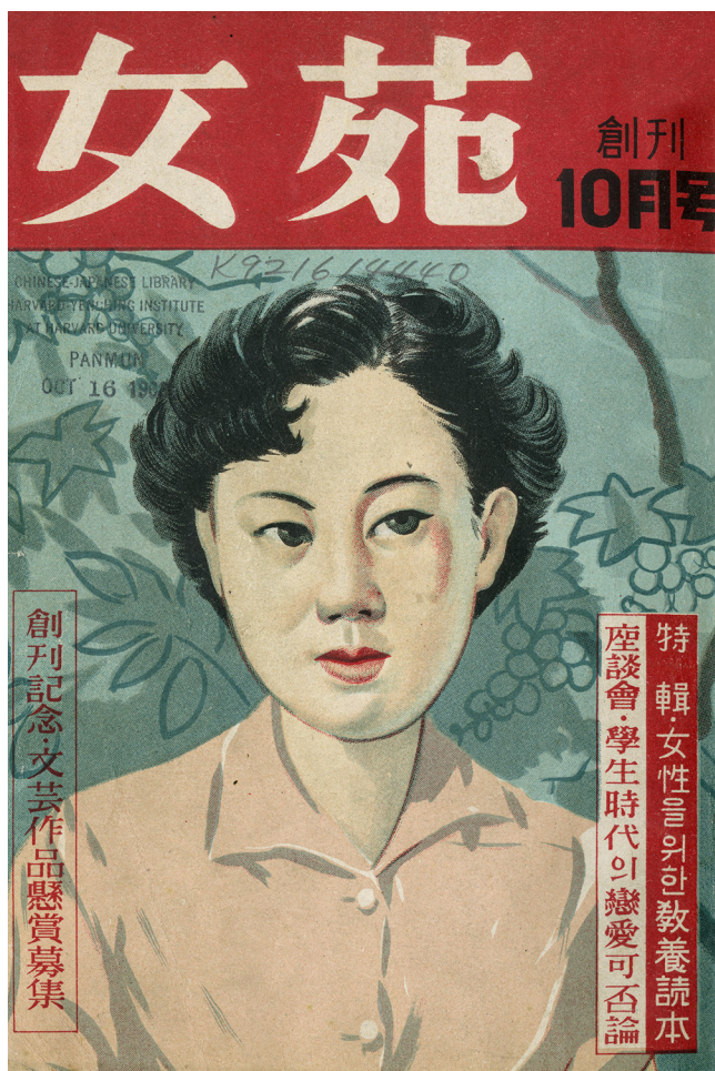
FIGURE 7. The first issue of Yōwŏn magazine, October 1955.

women such as a textile factory worker and a nurse. 28 The most innovative series was “Cutting-Edge Jobs,” which ran through most of 1958. It showed women working in occupations that fell far outside their traditional domain, including the first female chief editor of a magazine, a script girl at a film company, and a shorthand transcriber at the National Assembly. 29 One entry in this series showed a woman behind the wheel of a large American car, that evergreen symbol of modernity and autonomy (figure 8). The accompanying caption, which identified her as a taxi driver, noted that she had received good-driving awards from her current employer, the UN’s Office of the Economic Coordinator (the main distributor of US aid), thereby reinforcing the association of women’s progress with the West.