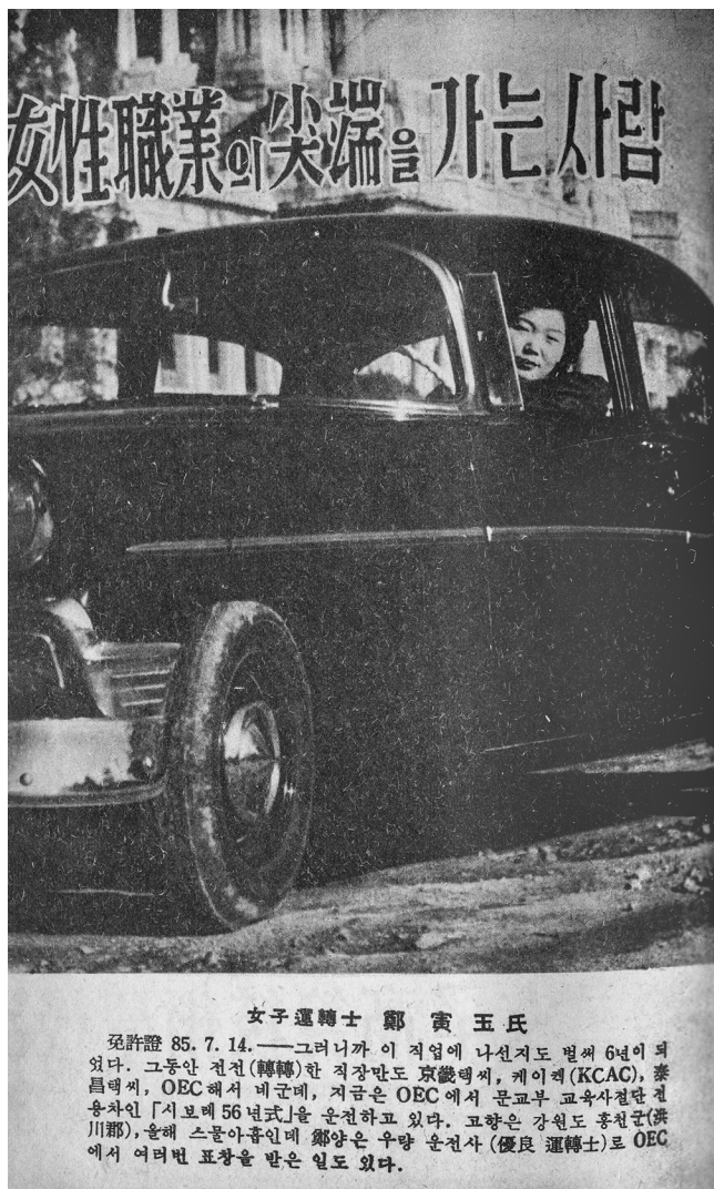
FIGURE 8. Female taxi driver in the series “Cutting-Edge Jobs,” Yŏwŏn , March 1958.

These photo series supported the editors’ pronouncement, published in the third issue, that “there has never been a time when the position of working women in society has been as conspicuous and important as the present.” 30