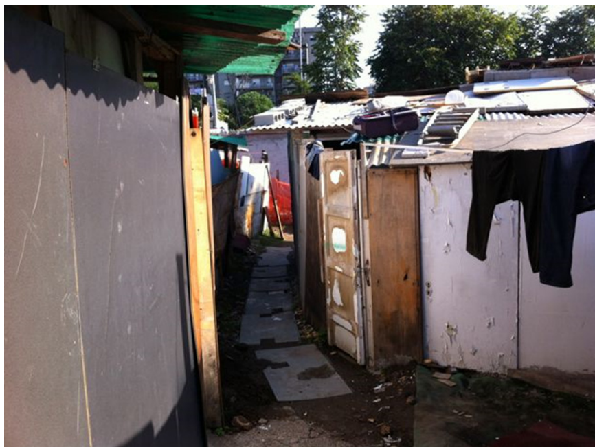
FIGURE 15. Ponte Mammolo, a now dismantled shantytown on the periphery of Rome (photo by the author, 2012)