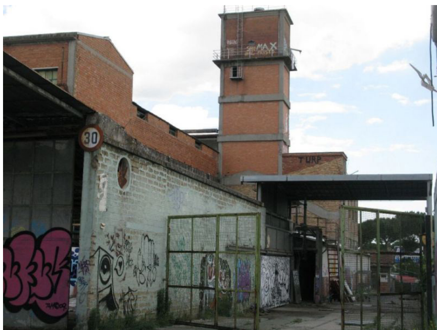
FIGURE 17. Metropolis, a squat inhabited by both Italians and migrants (photo by the author, 2012)