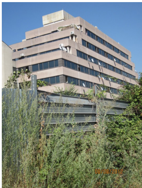
FIGURE 14. Collatina, the first squat inhabited exclusively by Eritreans and Ethiopians in Rome