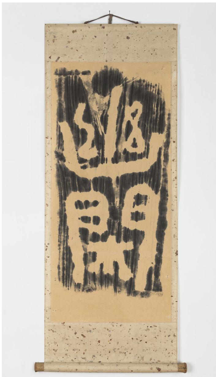
FIGURE 6. Saburo Hasegawa, Relaxing (Serenity) , c. 1951. Ink on paper; hanging scroll. The Noguchi Museum. This work was given as a gift from Hasegawa to Noguchi but was not identified until 2015, in the artist's studio, where it had hung for many years.