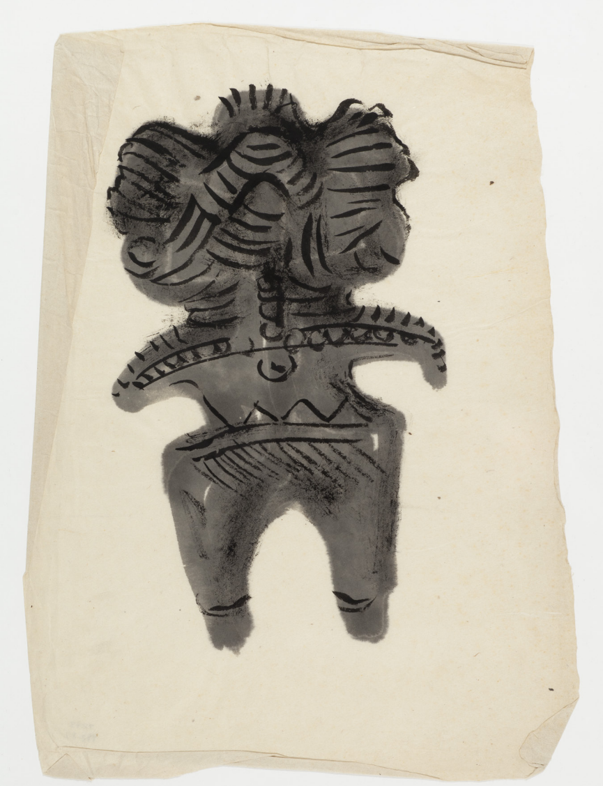
FIGURE 3. Isamu Noguchi, untitled drawing of Jomon figure, c. 1931. Ink on rice paper. The Noguchi Museum.