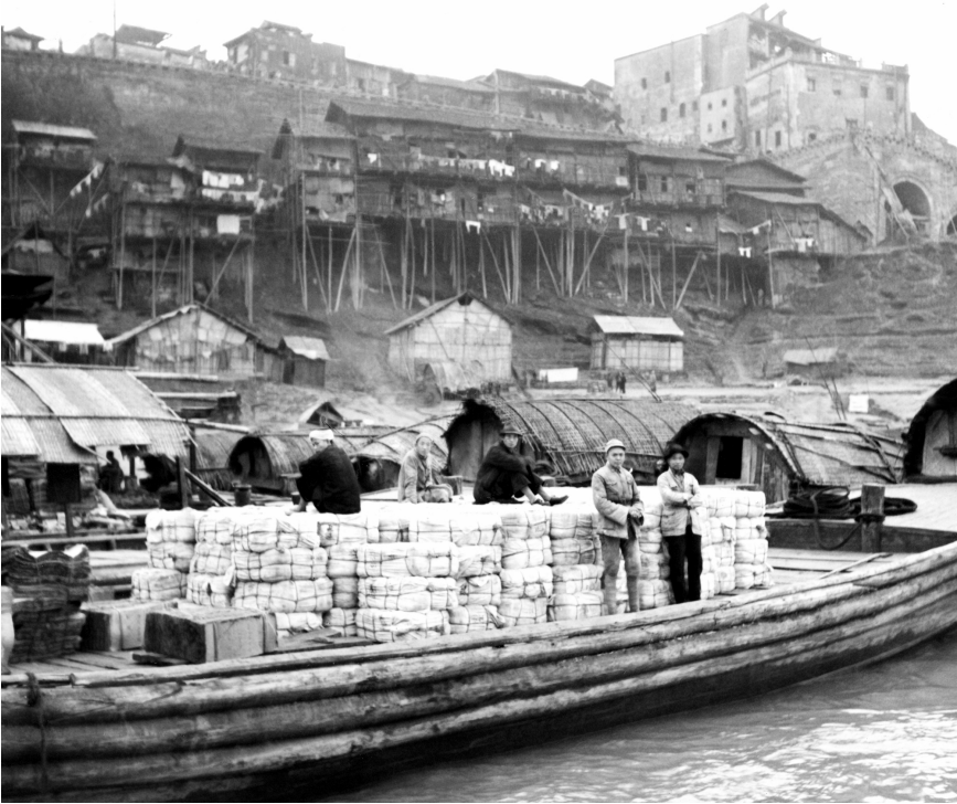
FIGURE 2. A delivery of cotton bales to Chongqing's river port, showing the famous riverside diaojiaolou, or "hanging foot buildings." January 15, 1944.