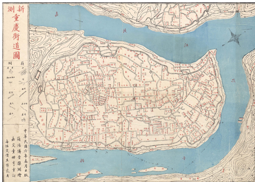
FIGURE 3. Map of Chongqing from 1917 showing the main city on the isthmus, with the northern and southern riverbanks flanking its sides. By the 1930s, those areas would become home to the more elite residences. Drawn by Fu Chung-Chii. Map 62089(1). The British Library.

incendiary bombs could consume thousands of the shacks in an instant; in April and May 1938, riverside residents suffered flood and fire back-to-back, leaving thirty thousand people homeless and more than one hundred dead. 25