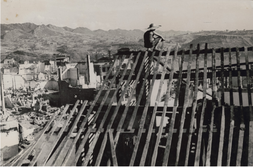
FIGURE 4. A lone man, observing the destruction of Chongqing, perches atop the home he is planning to rebuild. LOT 11511-7, WAAMD #131, U.S. Library of Congress, Prints and Photographs Division.

moonlight reflecting off Chongqing's rivers betrayed the city's precise location to Japanese pilots. (See fig. 5.) Some people began to suffer from nightmares, insomnia, and debilitating anxiety, and local health clinics hired mental health specialists. Yet most people showed a certain amount of resolve and did their best to accommodate the "new normal." When an air raid alarm sounded at mealtime, many people finished eating before heading to the nearest shelter. 36 Despite their horrific intensity, the raids failed to produce their desired outcomes: to cripple the Chinese economy and demoralize the people. In fact, Japanese bombing of China, American bombing of Japan, and Allied bombing of Europe alike all failed to achieve these goals, leading to a serious reconsideration of the value of air strikes in warfare. 37 Unfortunately, this meeting of the minds occurred only after the war, in the midst of the dusty rubble that had once formed majestic cities. By that time Chongqing topped a list of hundreds of destroyed cities around the world. From February 18, 1938, through August 23, 1943, when the ferocity of the Pacific War diverted the Japanese Army and finally granted Chongqing a respite, a total of 9,513 Japanese planes dropped 21,593 bombs on the city on 218 separate occasions, killing 11,889 and wounding 14,100 civilians. 38