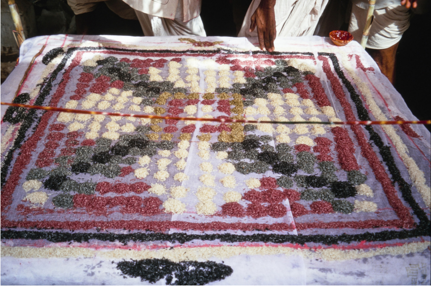
FIGURE 1.19. Mandala made of legumes in Jagat, May 2002, temporary maṇḍapa during goddess installation.

predictably graces the back niche. This temple has no auxiliary figures whatsoever. Although it was built after the Takṣakēśvara shrine in the gorge at Ekliṅgī, after the Datoresvara Mahadev temple at Śobhagpura, and after the Sūrya shrine at Tūṣa, this temple has a program similar to the Pippalāda Mātā temple in Unwās. Rather than displaying a rhythmic entourage of deities and attendants, the shrine invokes only the most basic deities. The exterior figures serve to show a correspondence with the interior deities and with the main deity's emanation on the back wall of the inner sanctum.