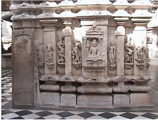
FIGURE 1.3. Śivēśvara temple, c. 950s–70s, Eklingī.

may have served as a monastic meeting space or lecture hall. Given the uncertain date of the main icon, it is even possible a living guru presided over some type of assembly. The inscription offers further evidence of the philosophical debates that may have taken place inside. 13 The visual pairing of the inscription with a statue of Sarasvatī may indicate a learned ascetic audience for this shrine. Those who used this building may not have needed elaborate emanations of deities to guide their already sophisticated practice. This temple may have served a set of Pāśupata ascetics in residence at Eklingī. 14