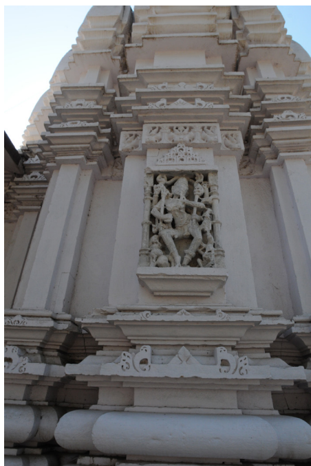
FIGURE 1.13. Cāmuṇḍā, Natesa temple, stone, c. 955–75, Hita.