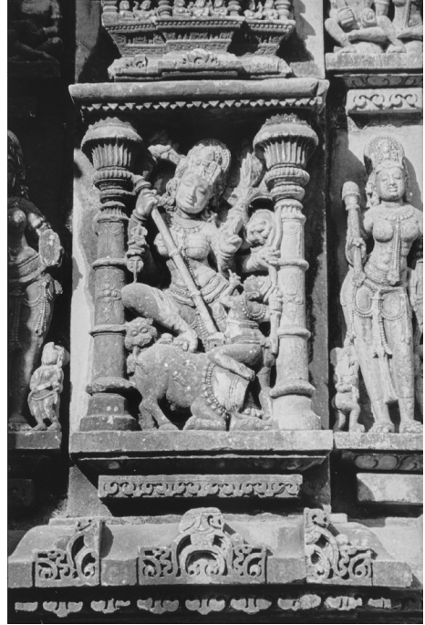
FIGURE 1.8. Durgā zoomorphic/anthropomorphic, side 2 (east/back), Ambikā temple, Jagat.

outward in every direction—the fourth direction, of course, is the interior opening to the garbhagrha sanctum, where the icon gazes out directly onto the viewer during worship. Each bhadra , then, has a niche on the exterior of the three outer walls of the temple sanctum. Exactly on axis with the inner icon, three of the same or three different sculptural deities represent the three directions in which the inner god of the sanctum is exuding power. Each manifestation geomantically reflects the directionality. For example, particularly fierce deities associated with death often face north. These axial protrusions and emanations form a sequence as the viewer circumambulates in the normal clockwise direction, or counterclockwise in an esoteric twist on the sequence that serves to relativize the passage of time or the inherent order of things.