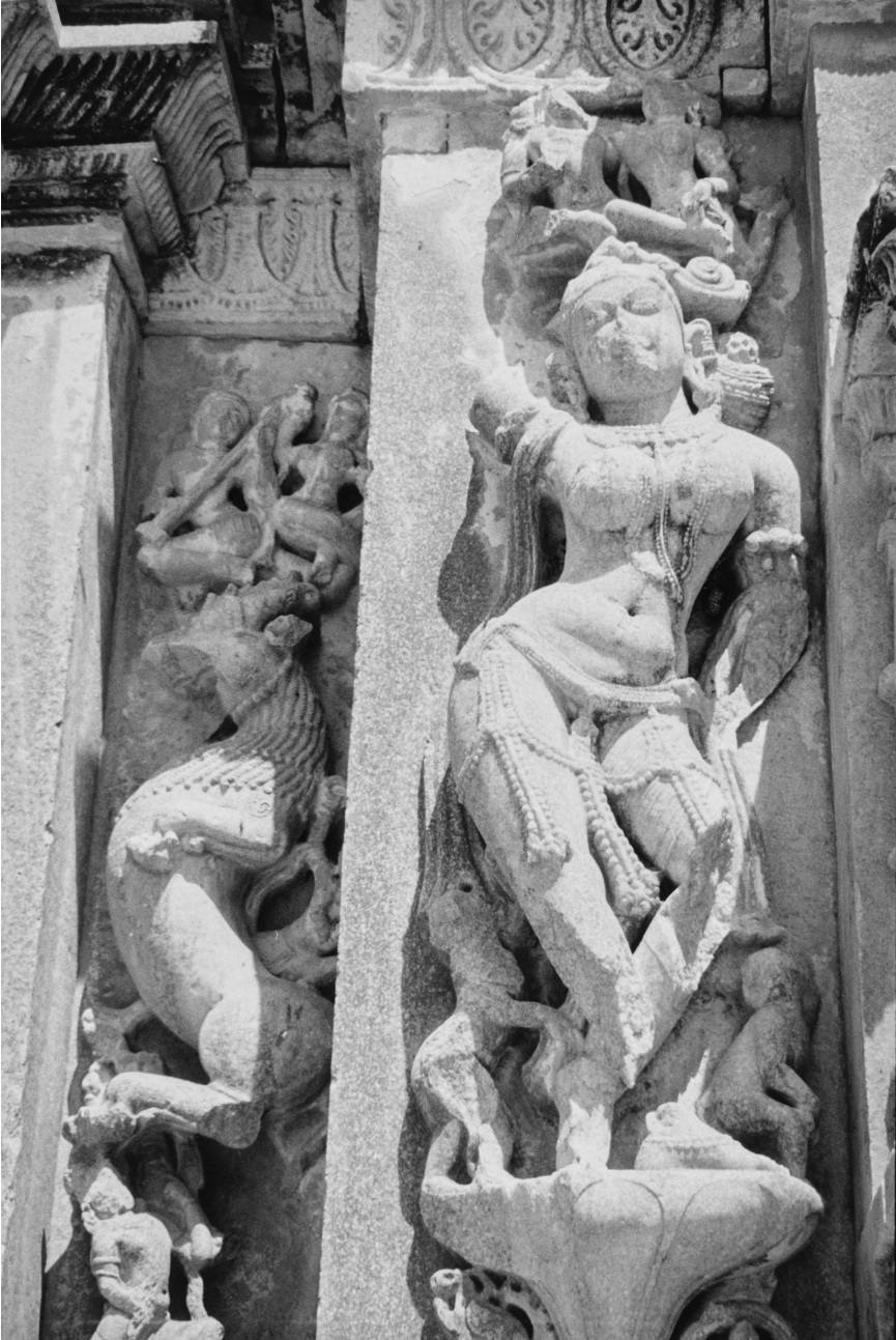
FIGURE 1.5 Surasundarī, Tūṣa.