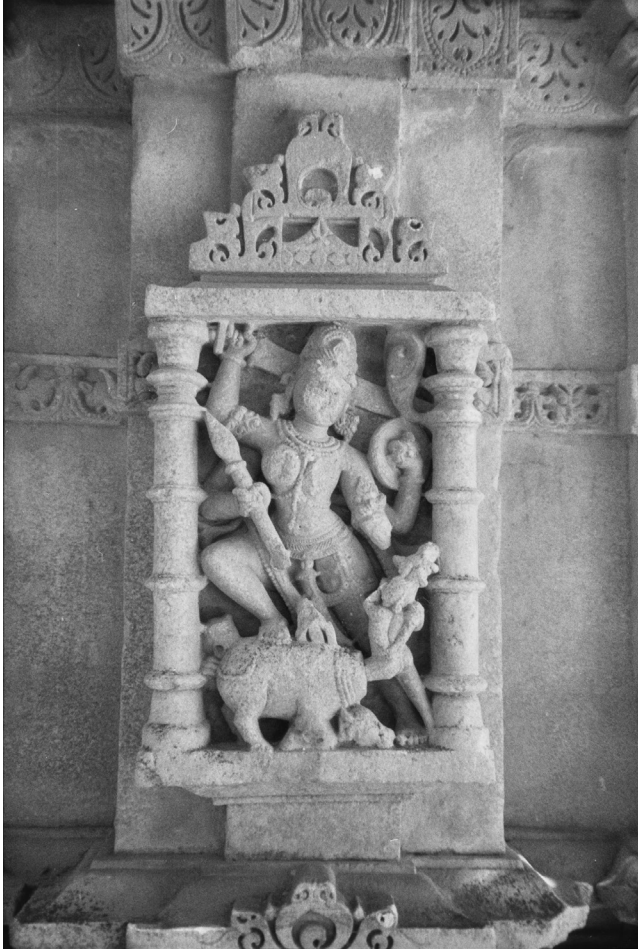
FIGURE 1.20. Durgā-Mahiṣāsuramardinī, c. tenth or eleventh century, stone, Nāgadā.

famous 971 CE debate among Jains, Buddhists, and Pāśupata Śaivaites was held—was already a multisectarian center for trade in the eleventh century. 41