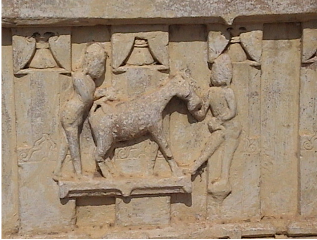
FIGURE 1.17. Bestiality on the temple wall, stone, c. twelfth to thirteenth century, Gamari.

toward Gujarat. 38 Whereas the quality of the art element of Gamari would not normally catch the attention of art and architectural historians, the scenes of bestiality (fig. 1.17) and other explicit forms of sexual embrace could be used to trace the religious record in stone—a tenth-century tantric inheritance from Āaṭ and Jagat still important enough in twelfth- or thirteenth-century Vagada to merit the expense and trouble of carving the stone and publicly erecting the stone architecture even though it was unlikely to be sponsored by any dynastic power.