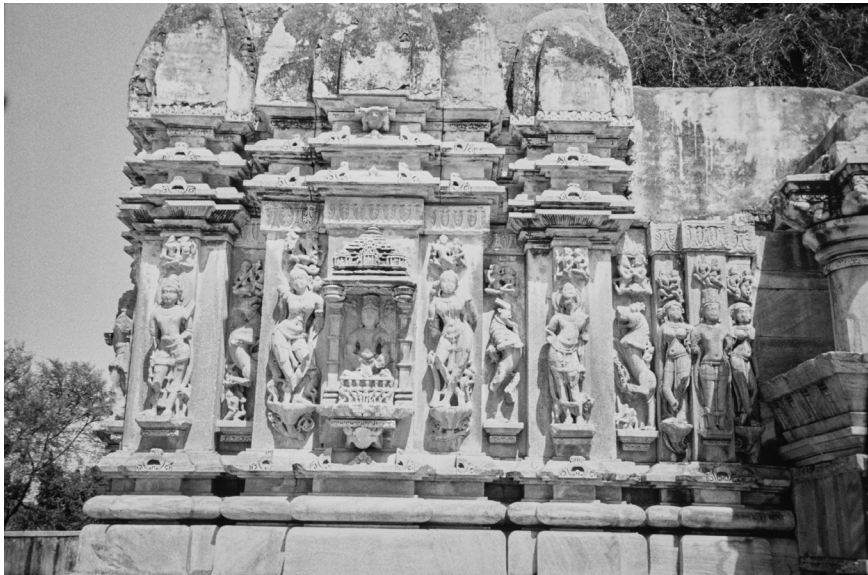
FIGURE 1.4. Sūrya on his seven-horse chariot, c. 950–75, Ṭūṣa.

One of the earliest works of tenth-century Mahā-Gurjara architecture in Mēdapāṭa is the Śaivaite Sūrya shrine at Ṭūṣa built, in all likelihood, under the reign of Bhartṛpaṭṭa in the second quarter of the tenth century. 15 Like the Ambikā temple at Jagat, the Sūrya temple at Ṭūṣa repeats three manifestations of the same deity adorning the exterior walls of the garbhagrha in each of the niches found on the three bhadra wall protrusions (fig. 1.4). In similar fashion Sūrya is flanked by two surasundarīs who are flanked by vyālas . The dikpālas guard the four corners of the shrine. In contrast with the Takṣakēśvara shrine, which shares this basic iconographic structure, the sculpture complements the protrusions and recesses in the temple wall. The presence of couples above the heads of the figures is a shared feature with the Ambikā temple, although here they sit rather awkwardly above the full figures without any architectural articulation, whereas at Jagat the couples sit on shelves within their own defined space.