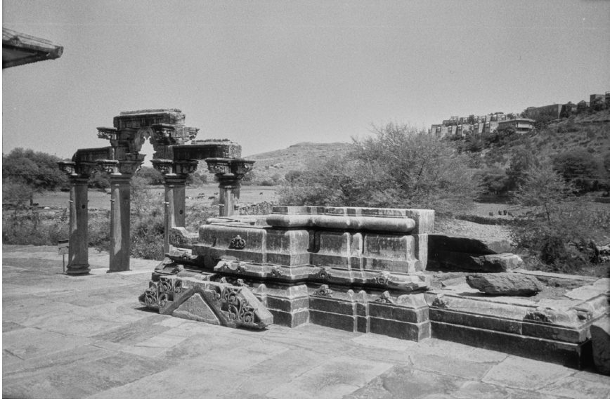
FIGURE 1.22. Toraṇa gate, Nāgadā.

style if not in iconographic content to the gate at Nāgadā (fig. 1.22). Two inscriptions from the eleventh century attest to the growing power of the Guhilas near Nāgadā and Ahar in the Mēdapāṭa region. 42 An inscription from Nāgadā dated to 1026 CE describes the town as “a renowned seat of scholars well versed in the Vedas.” 43 Unfortunately, the fragmentary inscription leaves the name of the ruler a subject of speculation. 44 Viṣṇu is invoked by the name of Puruṣottama in this inscription. The inscription at this grand site of Viṣṇu temples terminates with the symbol of the diamond lotus. Whether this motif is considered tantric or merely decorative, it was certainly multisectarian in early eleventh-century Mewār.