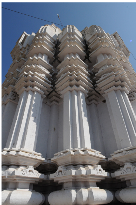
FIGURE 1.14. Exquisite śekhari architecture, Natesa temple, stone, c. 955–75, Hita.