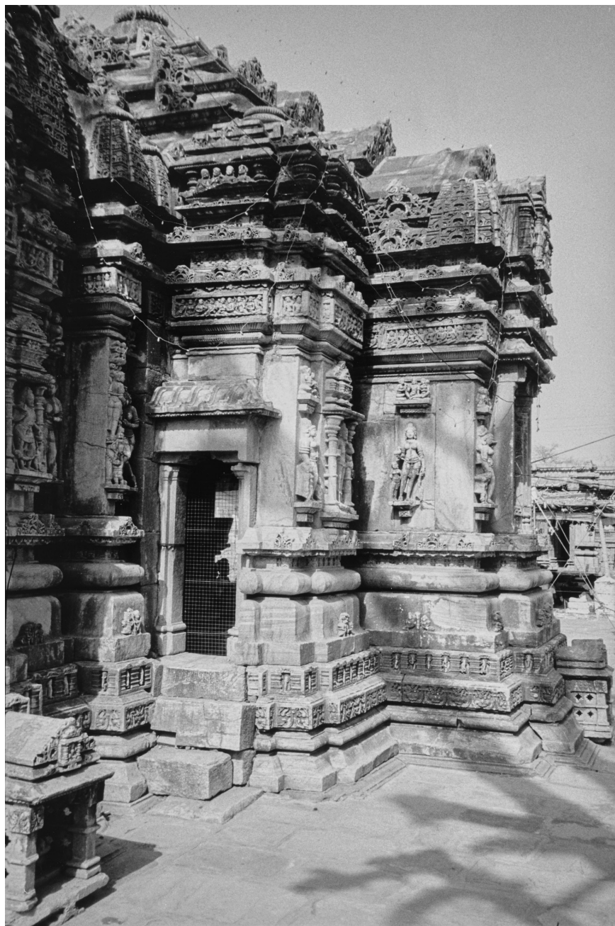
FIGURE 1.6. Door to sanctum on each side allows the bidirectional circumambulation, Ambika temple, c. 960, Jagat.