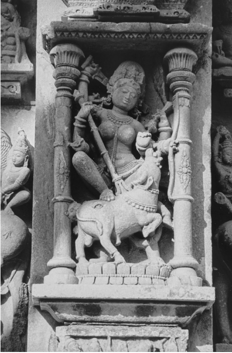
FIGURE 1.7. Durgā zoomorphic, side 1 (south), Ambikā temple, Jagat.