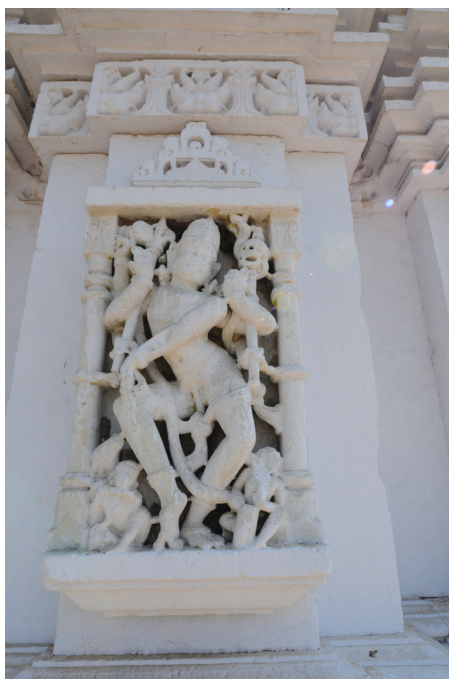
FIGURE 1.12. Natesa, c. 955–75, stone, Hita.