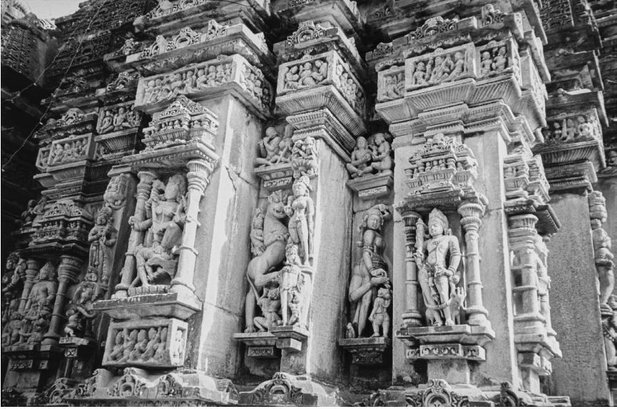
FIGURE 1.9. Durgā anthropomorphic, side 3 (north), Ambikā temple, Jagat.

the main icon. On the three walls of the temple sanctum the goddess plunges her trident into the flank of the buffalo demon, and three different times he seems to die in pain on each wall as the devotee circumambulates the structure. 31 If one faces the temple in normal circumambulatory order, with one's right side to the wall in clockwise fashion, three forms unfold on the southern, western, and northern walls. In the first bhadra niche, the zoomorphic form is quelled (fig. 1.7). In the second bhadra niche, the spirit in human forms begins to rise from the buffalo's sacrificed neck (fig. 1.8). And in the last bhadra niche, the goddess holds the fully human form of the spirit tightly by the hair (fig. 1.9). One could move from animal sacrifice to the vanquished spirit or, alternatively, in a left-handed tantric manner, from the vanquished spirit toward the sacrificed animal form. Either way, the double doorways suggest that the main icon was the fourth and main culminating component in either circumambulatory order.