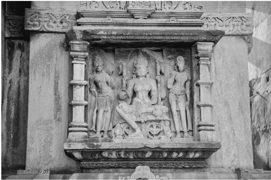
FIGURE 1.2. Saraswatī, Lakuliśa temple, Ekliṅgī.

An image of Saraswatī, the goddess of learning and the arts, flanks the entrance of the Lakuliśa temple to indicate a center of learning and may well provide the only extant example of a sculptural version of Saraswatī in situ on a tenth-century building known to have been associated with the acquisition of knowledge (fig. 1.2). Saraswatī rarely graced sculptural programs of tenth-century temples. Even unusual evidence, such as the inscription at the base of a female figure, does not provide a similar visual example of Saraswatī. Previously known as King Bhoja's Saraswatī from Dhar, a sculpture now housed in the British Museum bears an inscription linking it to a royally sponsored university. 9 Saraswatī's association with learning and the arts is well known, but the inscribed sculpture provides evidence only for her association with sites of learning and not for her visual representation within an architectural context. 10 She holds in her hand an elephant goad, a typical attribute of this goddess, who prods her disciples toward ever-greater acquisition of knowledge, an item that is even mentioned in guru-disciple initiation rites in Abhinavagupta's writings on tantra. 11