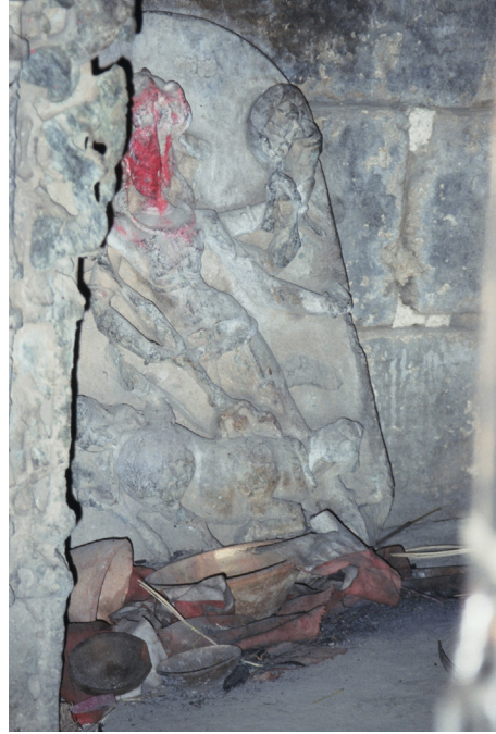
FIGURE 1.10. An icon cast aside inside the sanctum displays an emaciated form of Durgā in the act of killing the buffalo demon. Ambikā temple, quartzite, c. 960, Jagat.