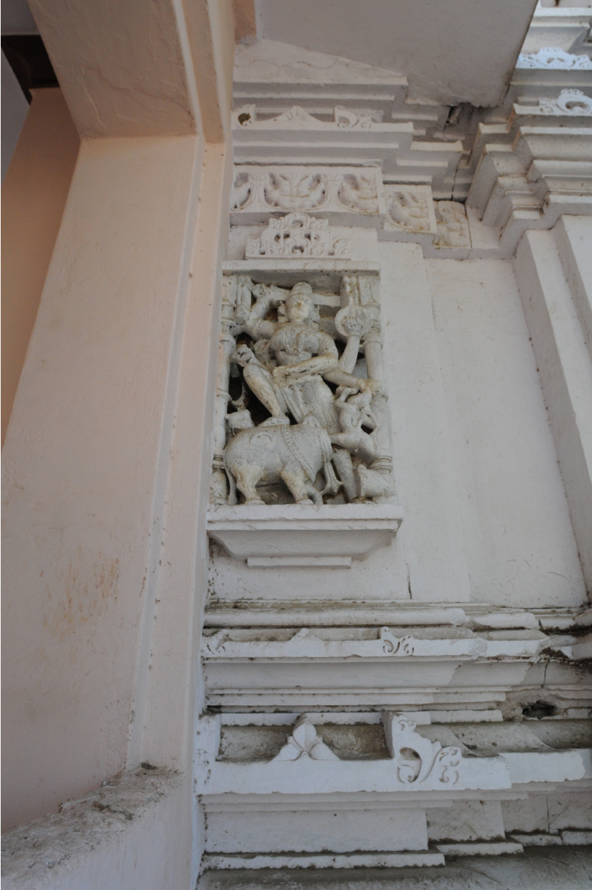
FIGURE 1.15. Durgā-Mahiṣāsūramardinī in the identical artistic style of Jagat, c. 960, Hita. © Deborah Stein.