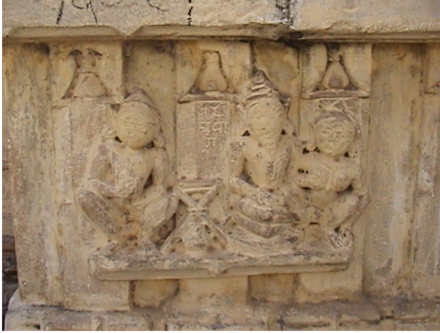
FIGURE 1.16. Guru and disciple on the temple wall, stone, c. twelfth to thirteen century, Gamari.

In the tenth century, when Hita and Jagat and Āaṭ were small temple towns, they lay on a route along the Som, north of the Narmada, where multiple estuaries connected them back to the great maṭhas of central India and down the river, through the birthplace of Lakuliśa, founder of Pāśupata ascetic Śaivism. Could Pāśupatas, goddess worshippers, and others have traveled from monastery to monastery through this back region of the Narmada between central India and the port of Khambhat—stopping along the way for tantric mediation and worship at three or more interconnected temples in Hita, Jagat, and Āaṭ? Ojha recorded an inscription from Āaṭ in his Dungarpur Rajya ka Itihas , and the remains found there suggest a thriving Pāśupata center with possible Jain remains and radically explicit sexual imagery, better-sculpted and yet linked stylistically through similar representation of pectoral muscles in stone to the bestiality and other motifs found farther south at sites such as Gamari.