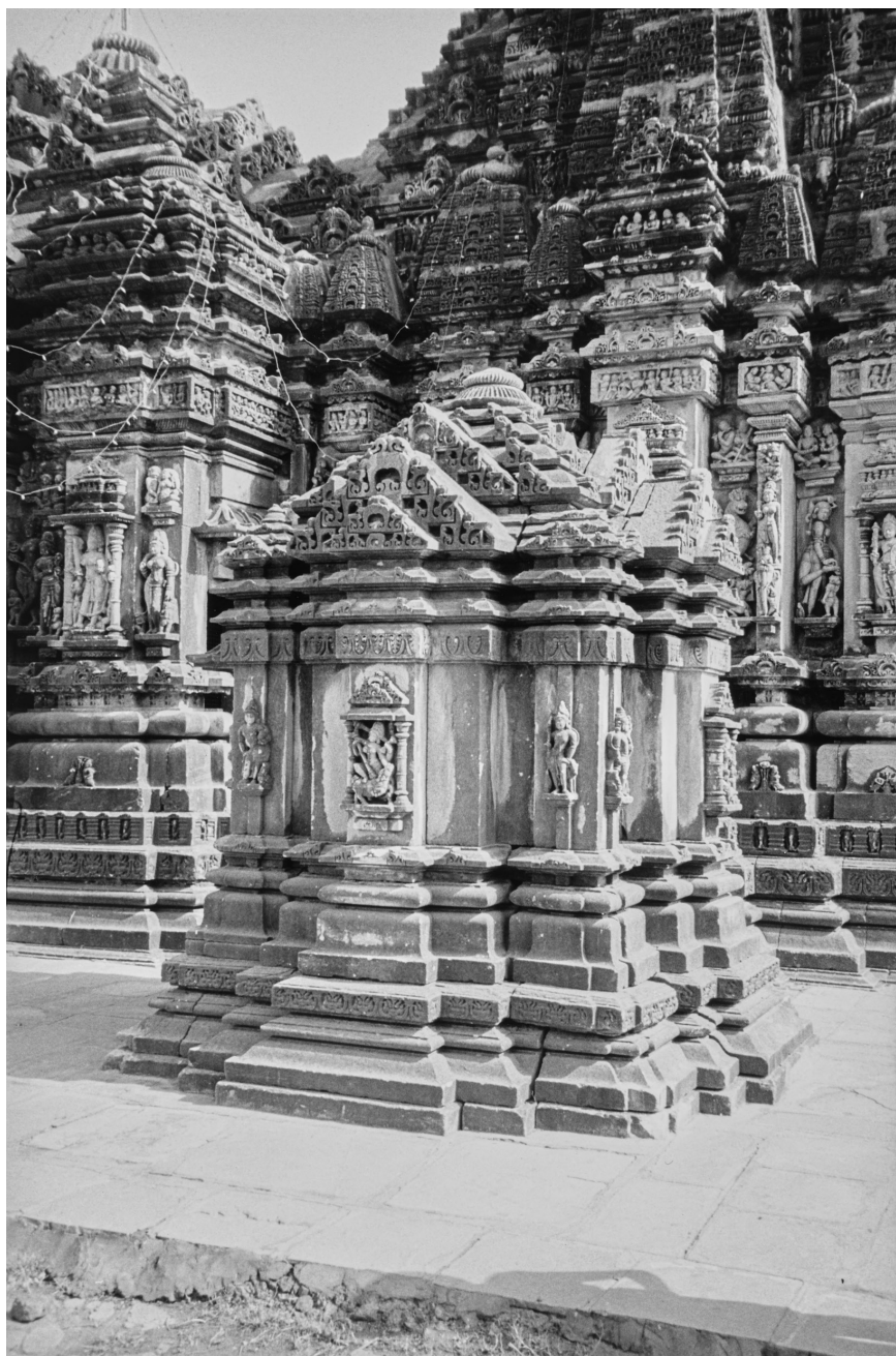
FIGURE 1.21. Jagat prañālā , demon's leg protruding out of the neck of the decapitated form.