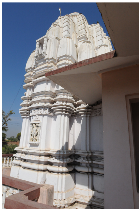
FIGURE 1.11. Ferocious Śiva (Andhakāntaka?), c. 955–75, stone, Hita.