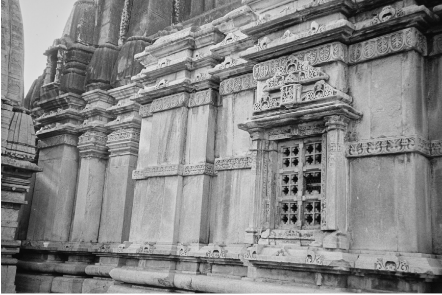
FIGURE 1.1. Lakuliṣa temple, c. 971, Ekliṅgi.

sect is also found in the lintel of the doorway of the Lakuliṣa temple at Ekliṅgi. 7 He came from Karvana and lived sometime in the second century CE. Lakuliṣa had four pupils—Kusika, Gargya, Krusha, and Maitreya—who gave rise to four branches of Pāśupata-Śaivism. The Lakuliṣa temple inscription, located to the left of the temple entrance, suggests that the ascetics of Ekliṅgi were part of the Kusika lineage. 8 The powerful Paramāra dynasty, which built the temples at Arthuna in the early eleventh century, was also Pāśupata-Śiva. To the east Lakuliṣa was worshipped at tenth-century sites such as Bijoliā in Upamāla territories; and to the south, in the Lata country and in Anarta, Lakuliṣa was worshipped in his celebrated birthplace. By espousing this Pāśupata leader, the Guhilas could establish their independent territories as Pratihāra power dwindled in the region.