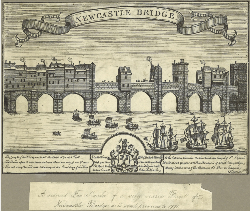
FIGURE 9.1. John Hilbert. Medieval Bridge, Newcastle upon Tyne, ca. 1727. Engraving. By permission, Newcastle City Library (accession no. 15399).

consequences of industrialization processes that began to develop rapidly in the late 1700s. The birthplace of the world’s “first industrial nation,” Northeast England offers a case study of how the processes of industrialization quickly diversified, replicated, and refined elsewhere in Europe and on the North American continent (Crosby [1986] 2004). In the nineteenth and twentieth centuries, industrial transformations based on fossil fuel exploitation were witnessed globally, from the Indian subcontinent to the Far East and China to Latin America (Osterhammel 2014). What happened in Newcastle during a sudden flood event under conditions of the early Anthropocene could provide clues about the long-term trajectory of the industrialized world.