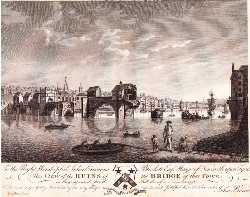
FIGURE 9.2. Engraving showing postflood ruin of the Tyne Bridge. Illustration from John Brand, History and Antiquities of the Town and Country of Newcastle upon Tyne , 2 vols. (1789). By permission, Dr. Peter Wright (private collection).

the southwest of England, was called in to do a survey of the bridge, and estimated in the year before the flood, 1770, that £150–200 were needed for urgent repairs—but nothing was done (Garret [1818] 2010).