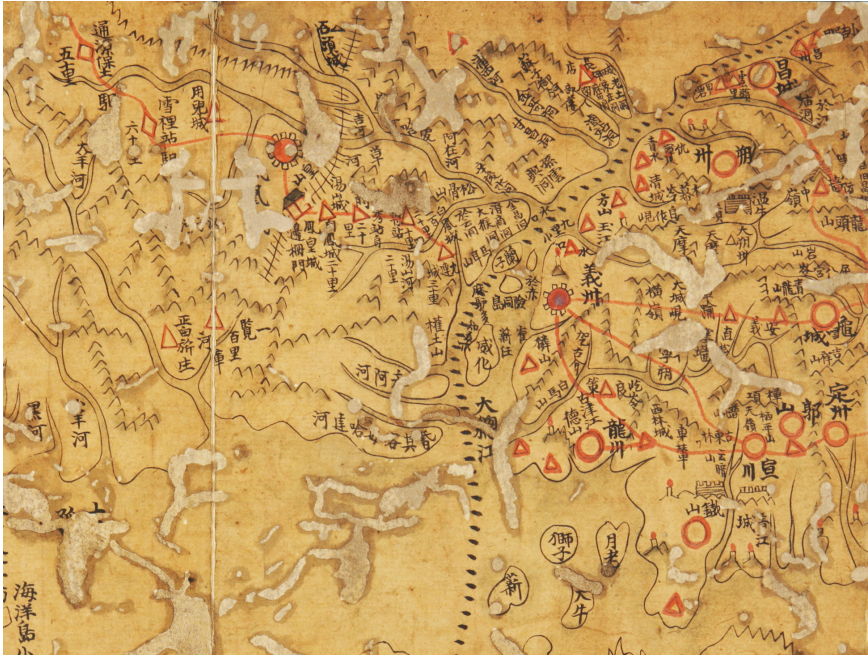
FIGURE 8. The Fenghuangcheng gate, the Yalu River, and Üju. Details from Sōbuk kyedo (map of the northwestern boundary), 1777–91. Manuscript, 140 × 135 cm. Kyujanggak Institute for Korean Studies of Seoul National University, no. ko 4709–89, vol. 5. Used with permission.

and Huanggou outside the eastern line of the palisade. This region was located to the southeast of Elmin and Halmin, the old ginseng preserve in Shengjing. When Yong-fu's proposal was delivered to Beijing, however, the primary concern of the Qing court was not the probable ginseng yield of Bendou and Huanggou but rather the likely reaction of the Chosŏn court, which had been very displeased with the idea of Qing soldiers or ginseng gatherers approaching its territory. In the end, the Qing court rejected the proposal, reasoning,