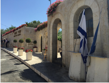
FIGURE 29. Entrance to the City of David Archaeological Park.

The most active and effective group to challenge Elad's mission in the City of David is Emek Shaveh, which is invested in informing the public of how political and religious ideology is implicated in the current excavation and tourist initiatives in Silwan to the detriment of its Palestinian inhabitants. 36 Established and directed by two Israeli archaeologists, this group interacts closely with the Wadi Hilwe Information Center, a Palestinian organization whose mission is to build a strong, well-informed, and involved Palestinian community and to provide educational and recreational courses for young people. 37