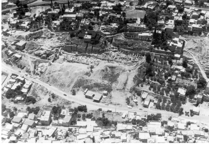
FIGURE 27. The densely built-up area of the Palestinian neighborhood Silwan, in the midst of which the City of David Archaeological Park was established.

Silwani villagers live in modest, often improvised housing—a mix of stone, concrete, and steel construction—built alongside lanes and roads, some of which are unpaved. The City of David Visitors Center, the surrounding archaeological park, as well as the settlers' houses, in contrast, are beautifully built and maintained, speckled amid the Palestinian village and connected by newly paved streets. The gardening and numerous Israeli flags make for additional unmistakable attributes of the recent urban transformations initiated and financed by both the Jerusalem municipality and Elad. Tourist trails lead visitors through well-designed spaces, some of which are above ground, but most of which are expanding underneath the private and public buildings of the Silwan neighborhood. Since the mid-1990s, millions of visitors have explored the excavated features, treading in the footsteps of dozens of adventurous explorers on a journey to discover physical remains embodying the biblical narrative. 4 Two realities seem to be ignored, however, by most visitors: the many centuries of historical legacy that link the Palestinian Silwani to this place and the lack of archaeological data on the Southeast Hill supporting the biblical narrative of King David's conquest and rule in the city.