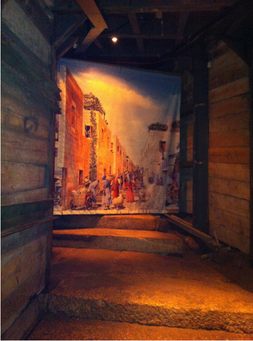
FIGURE 30. Herodian street section with artist reconstruction of Second Temple period pilgrimage scene.

conquest was debunked? And how do these mobilize the interest and attention among hundreds and thousands of tourists annually? The archaeological findings in Silwan certainly carry an intrinsic value and are instructive in relation to Jerusalem's early history, in particular regarding the city's water and fortification systems. But in spite of the expeditions' persistent focus on early periods and their minor engagement with post-Byzantine remains, the significance of the discoveries with regard to the biblical narrative is limited, if not completely absent, for the periods associated with the rules of David and Solomon. It appears that the holiness that the City of David holds for some is recent, ideologically motivated, and not anchored in the tradition of an ancient sanctuary.