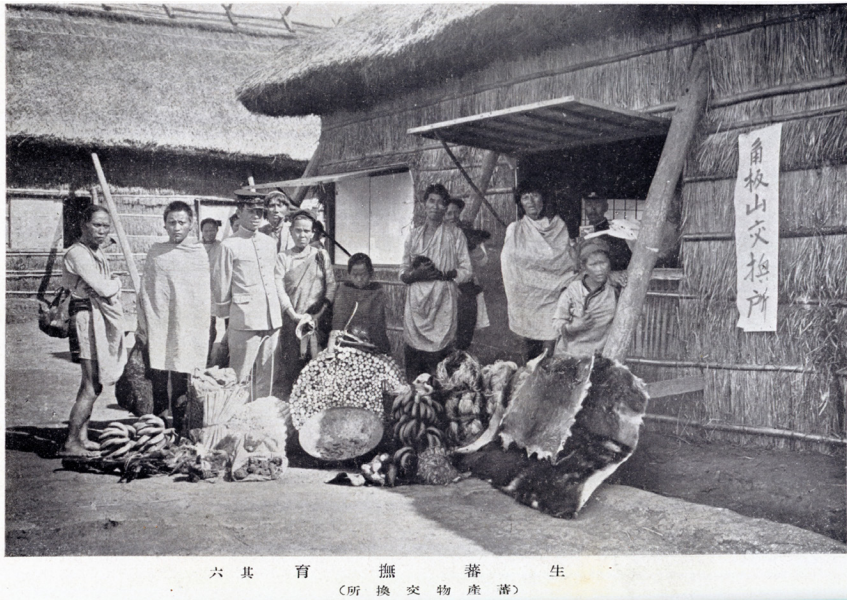
FIGURE 30. Trading post at Jiaobanshan. Riban Gaiyō (Taipei: Taiwan sōtokufu minseibu banmu honsho, 1913), n.p.

matches, and so on”; “buttons, all colors of wool thread, combs, tobacco, Nanjing pearls, and so on”; and, for especially meritorious service, guns and ammunition.