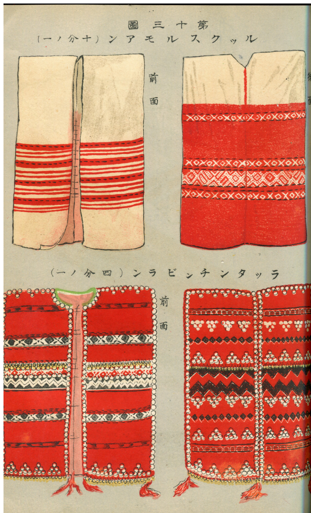
FIGURE 28. Illustration of Atayal textiles from Japanese ethnological survey, ca. 1915. Kojima Yoshimichi and Kōno Kiroku, eds., Banzoku kanshū chōsa hōkokusho (Taipei: Rinji Taiwan Kyūkan Chōsakai, dai 1-bu, 1915), n.p.

sketched, photographed, and collected these items, then supplied museums and expositions with evidence of indigenous ethnic integrity, local genius, and archaic vibrancy. Concurrently, trading-post operators accepted Atayal cloth as specie and retailed it to tourists and collectors, diffusing weavings widely to Japanese and international collectors.