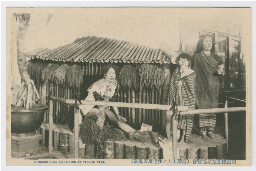
FIGURE 29. A diorama from the 1913 Osaka Colonial Exhibition with Atayal red-striped capes prominently displayed as “The household of the Taiwanese natives and its customs and manners.” “Grand Colonial Exhibition at Tennoji Park,” ip1472, East Asia Image Collection, Lafayette College, Easton, PA, accessed July 26, 2017, http://digital.lafayette.edu/collections/eastasia/imperial-postcards/ip1472 .

Much of the indigenous cultural material that was photographed or preserved for posterity was collected during the “lost decade” of Japanese rule (1895–1905), which is usually considered a period of passivity, at worst, or simplistically as one dominated by a policy of “nurture.” However, during this decade, the peoples beyond the savage border who had kept the Qing state at arm’s length dazzled Japanese officials in search of allies and informants with their song, dance, festivals, folktales, and handicrafts. Indigenous emissaries to feasts and parleys posed for photographs and paintings; indigenous artifacts were collected by rural officials in exchange for tobacco and red thread that was subsequently distributed to shore up headmen’s claims to authority; and indigenous textiles purchased in cross-border trade were boxed up and shipped to Japanese museums and industrial expositions to line the pockets and enhance the profiles of Japanese anthropologists (see figure 29). These myriad transactions had the cumulative effect of institutionalizing a view of indigenes as racially and culturally distinct from each other and from Han Taiwanese.