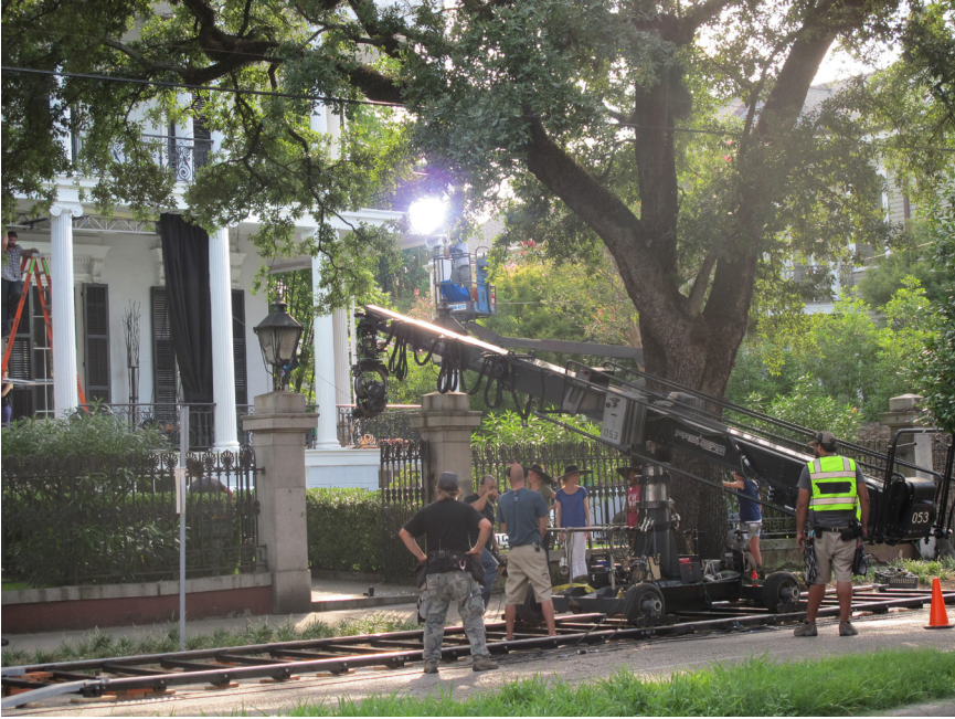
FIGURE 16. A filming location in the Garden District, where some of Hollywood South's elite reside but where production activities are restricted.

decide how much exposure to the film economy is “tolerable.” A few gripers, she explained, should not be allowed to overshadow the silent “thousands of residents in the city who support the film industry.” 72 In other words, the media production elite is welcome to regulate their own exposure to the impacts of the film economy, while everyone else must be complicit.