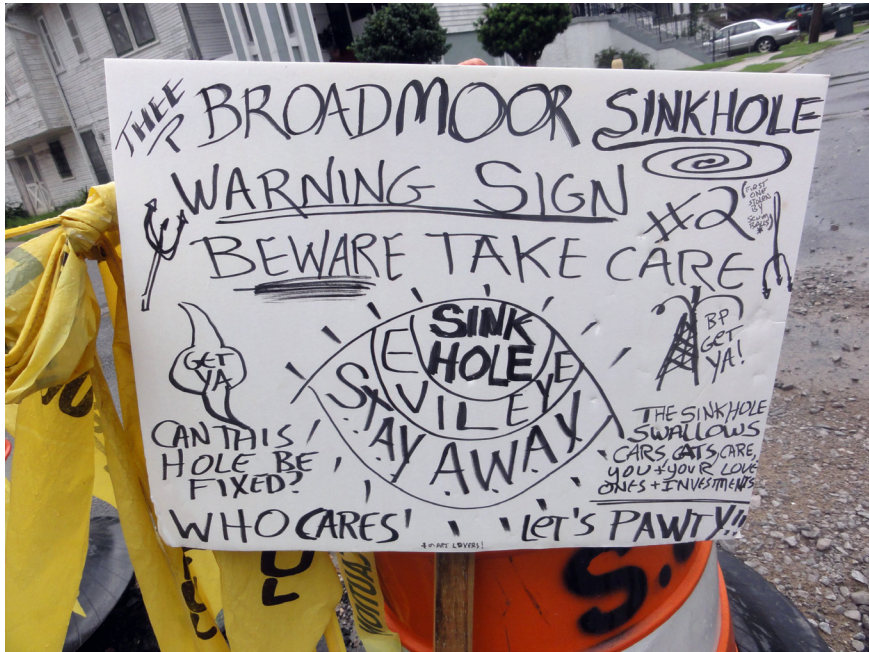
FIGURE 15. “Thee Broadmoor Sinkhole.”

their own decorative street signs to direct officials where citizens lived and needed assistance. They hand-penned signs to hail utility workers to broken power lines after Hurricane Isaac left the majority of the city in darkness in 2012. Neighborhoods that competed for public spending used dark humor to remind the city of its spending priorities. Potholes have sported welcoming placards for city employees to visit, likening the gaping sinkholes to tourist attractions, such as the Grand Canyon or mystery caverns. When the city sponsored an international public arts exposition as an official attraction in 2008, a series of handmade signs appeared to tell readers, “You Might Be Wrong.” Later associated with the expo itself, the signs drew the elite and culture vultures alike into debates about citizens’ mutual responsibility and/or arrogance in the city’s recovery efforts.