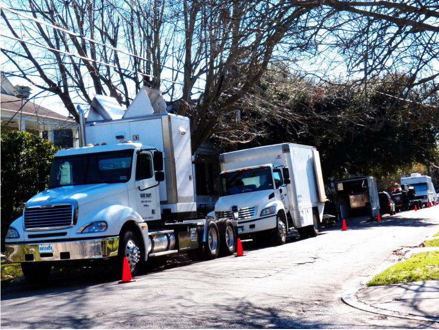
FIGURE 9. Spatial impacts of location shooting on an Uptown residential neighborhood. Photo by Aline Maia, reproduced with permission.

The symbiosis of development aims between Hollywood film producers and Louisiana government officials can be traced to a small revision in the state tax code in 1990. In it, the code articulated Hollywood's role in a new economy: "It is hereby found and determined that the natural beauty, diverse topography, and architectural heritage of the state, the wilderness qualities and ecological regimen of its scenic rivers system, and the profusion of subtropical plants and wildlife provide a variety of excellent settings from which the motion picture industry might choose a location for filming a motion picture or television program, and together with those natural settings, the availability of labor, materials, climate, and hospitality of its peoples has been instrumental in the filming of several successful motion pictures." 14 The implication was evident in the wording: the film industry needs locations, and Louisiana has them. Added to this, Louisiana would sweeten the pot with accommodating weather, workers, and studio-ready warehouses to create a film-friendly destination. In return, the code continued, "The multiplier effect of the infusion of capital resulting from the filming of a motion picture or television program serves to stimulate economic activity beyond that immediately apparent on the film set ." 15 The tax code envisioned a virtuous exchange between