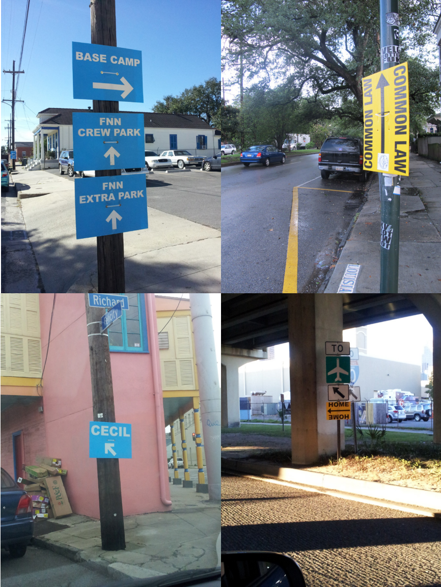
FIGURES 11–14. Filming location signs are ubiquitous but speak in code.

claimed imminent domain in entering and seizing their residences. Some of these signs were not so subtly spray-painted on the sides of abandoned refrigerators tossed out with their rotting contents. Locals soon grew accustomed to fashioning