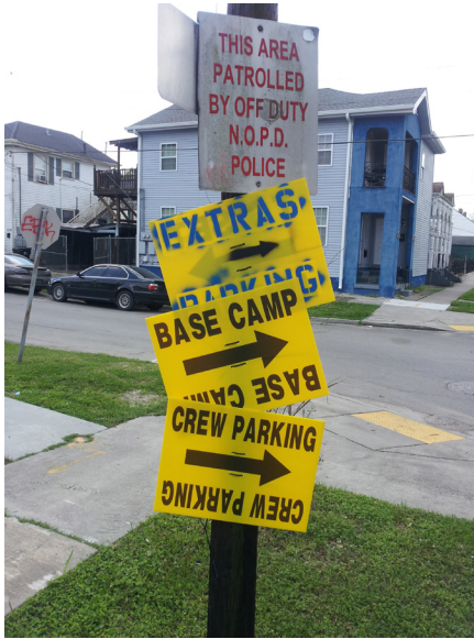
FIGURE 10. Signs directing workers, including police details, to a neighborhood film-production location.

spaces and their public caretakers in the city are for sale; they are part of a market that few people can access in such a privileged way.